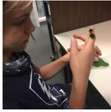
CONNECT 2 NATURE