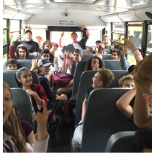
BUSES HOME ONLY