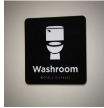
WE ARE UNIVERSAL